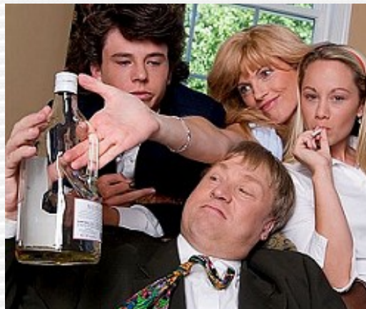
The nuclear family of All Along

It's about a man who is going through a mid-life crisis. Richard (the main character) gets taken to an amusement park by his wife and kids for his 40th birthday. He runs into an old high school sweetheart and he then goes into a series of daydreams and fantasies that start interacting with real life which results in some humorous and embarrassing situations. He visits a psychologist to discuss the fantasies and tries to realize what it is that is happening to him.